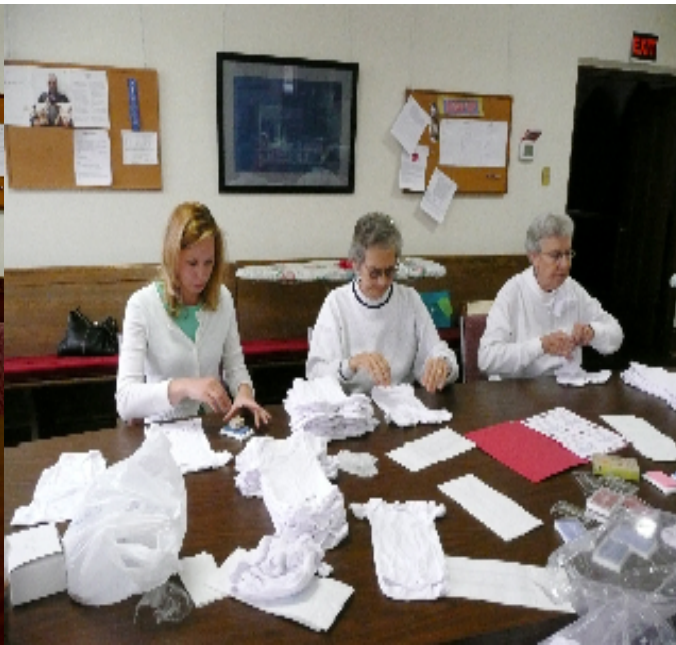
St. Stephen's ladies hard at work!