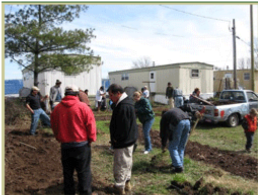
Working with families in a local trailer court to put in a vegetable garden.