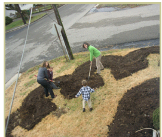
This design reduces heavy digging, weeding and watering.

In addition, the market garden seeks to collaborate with people in "difficult life circumstances" (our most marginalized in Harrisonburg, generally people who are homeless or unemployable). These folks are Creation Care Apprentices within our sustainable living center program. In this capacity they have a chance to gain job reference and experience, make a small amount of income (from sales at the farmers market along with a small initial amount of funds from one of our grants), and gain a healing experience with the earth. The market garden is local, organic, and the produce transported by bicycle trailers. Our goal is to create healing and meaningful work for people in need, chemical/pollution free food, and zero emissions food production.